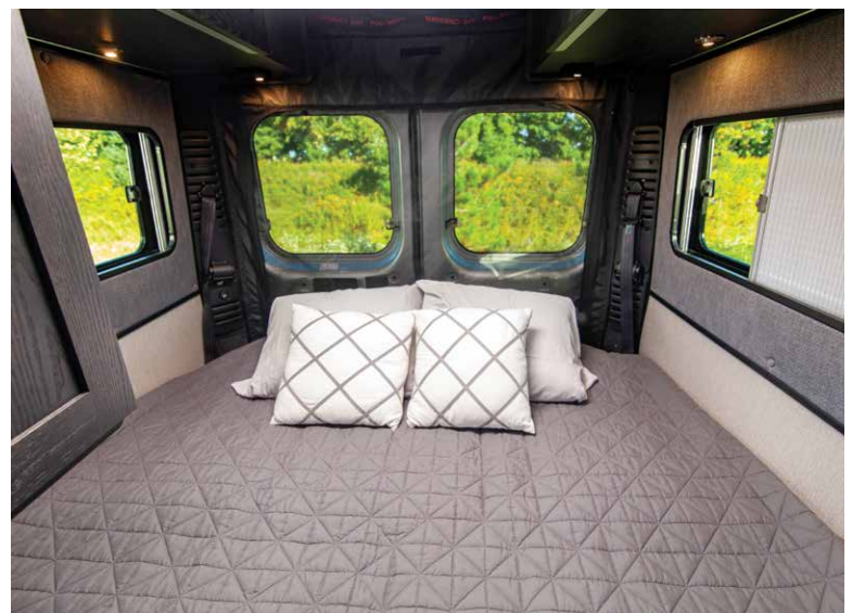
Rear sofa easily converts to a comfortable queen size bed.