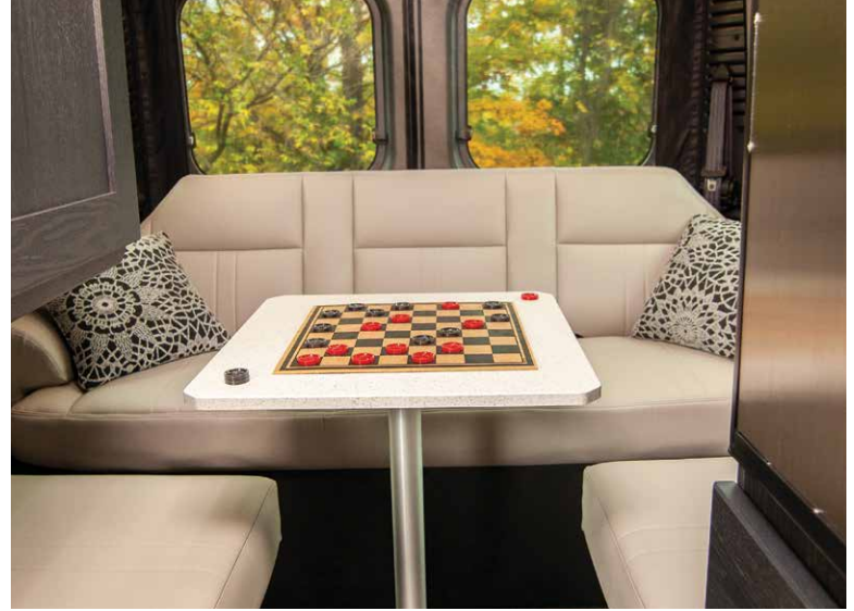
The rear lounge area is perfect for game night, dinner or watching TV.