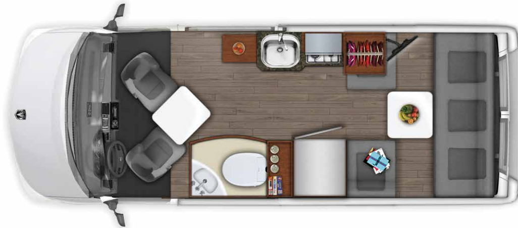
Interior floor plan daytime.