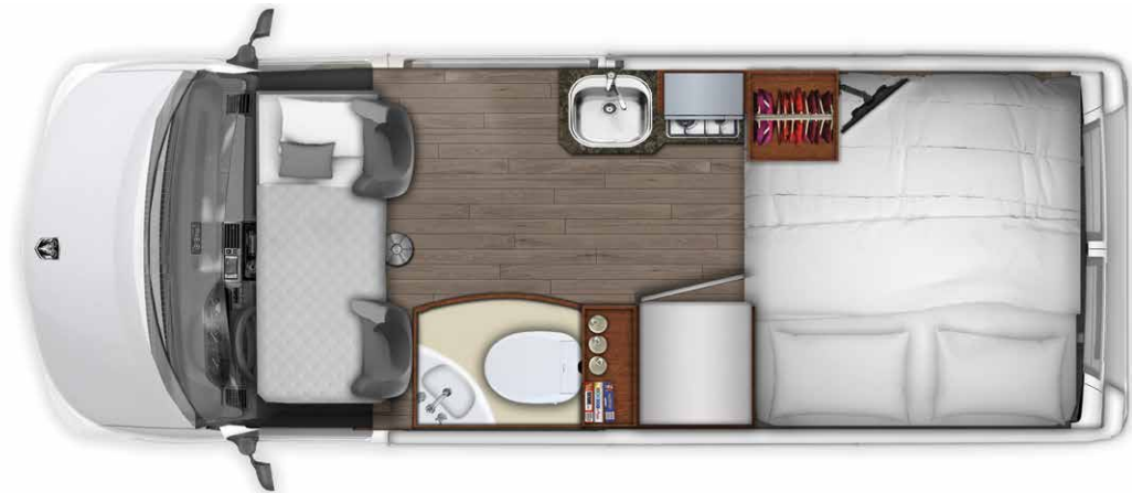
Interior floorplan evening with queen bed set up. (Shown with optional front folding mattress.)