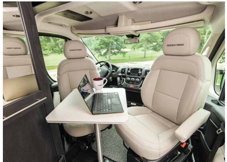
The comfortable and roomy front seating area is a great place to work, eat or just relax.