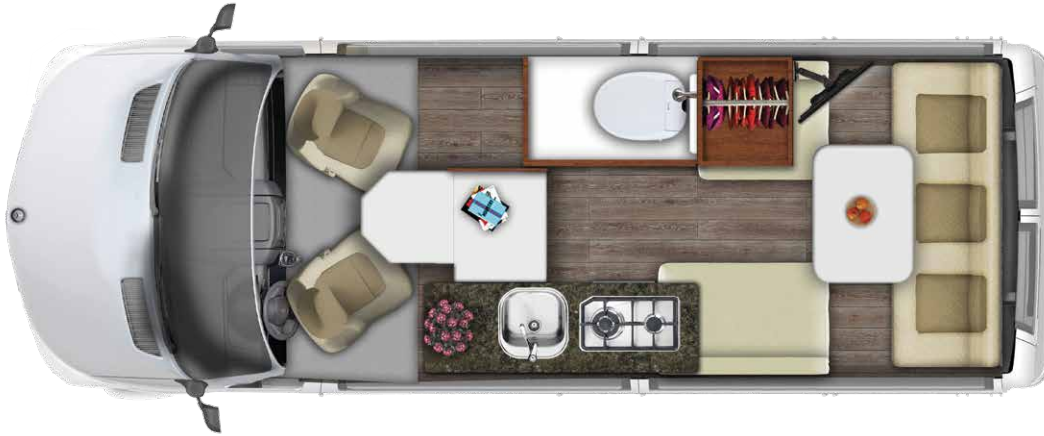
Interior floor plan daytime.