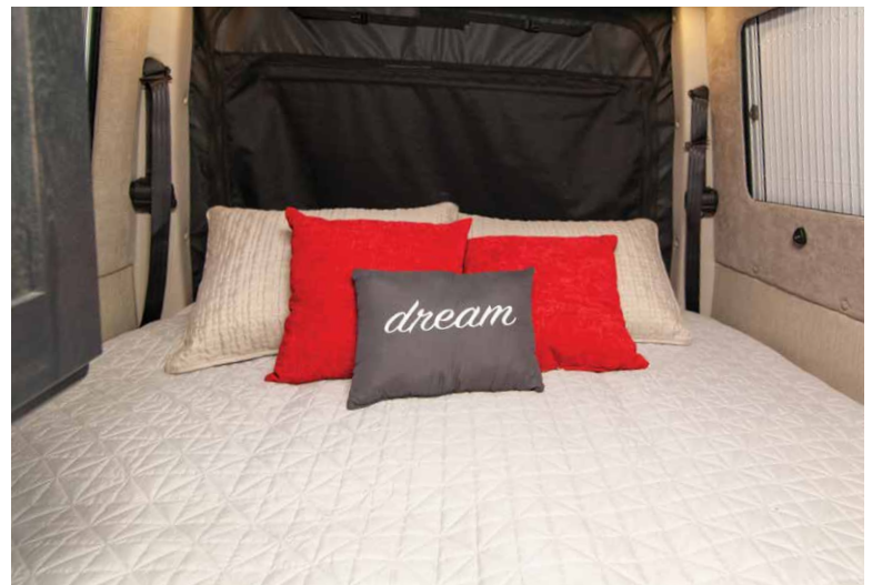
Rear lounge area easily transforms into a sleeping area with a comfortable king size bed.