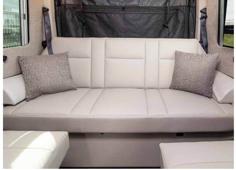
Rear lounge area is a comfortable place to sit, dine or relax and offers seating for up to three passengers.