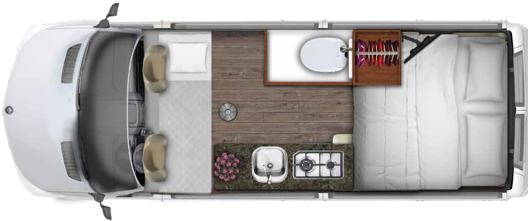
Interior floor plan evening. (With optional front folding mattress.)