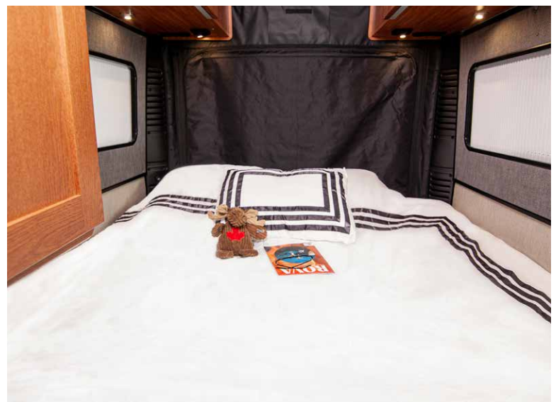
Rear lounge area easily transforms into a sleeping area with a comfortable king size bed.