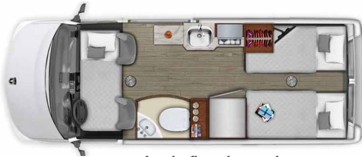
Interior floor plan evening. (Shown with optional front folding mattress.)