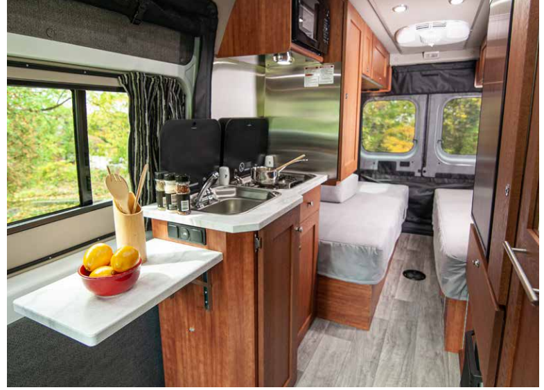
Open aisle floor plan allows for flexibility in sleeping accommodations and storage of large items.