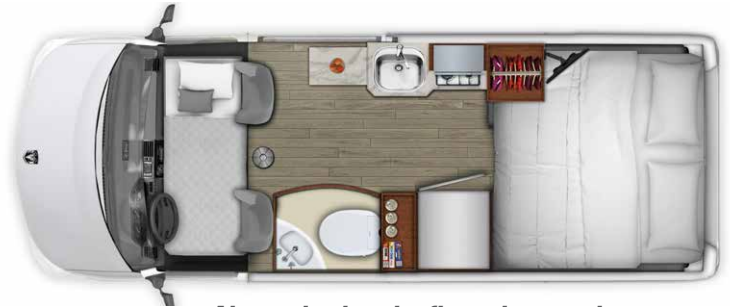
Alternative interior floor plan evening. (Shown with optional front folding mattress.)