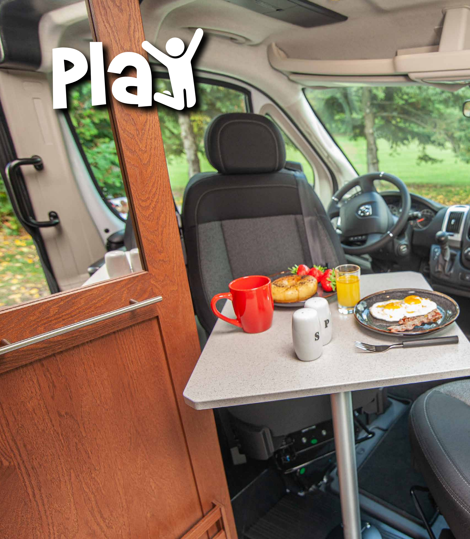
Spacious front dining area comfortably seats two.