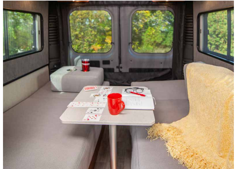
Rear lounge and twin bed area offers a great place to relax, work or dine.