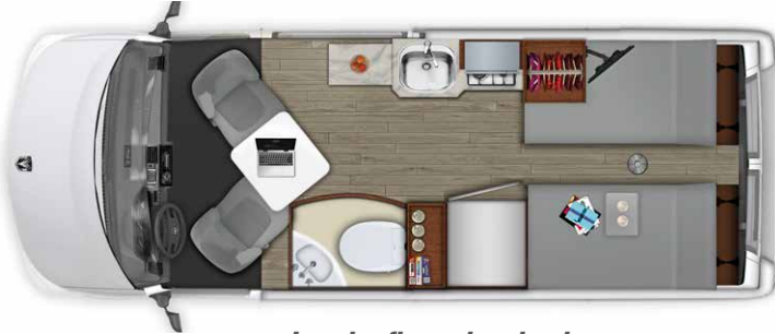
Interior floor plan daytime.